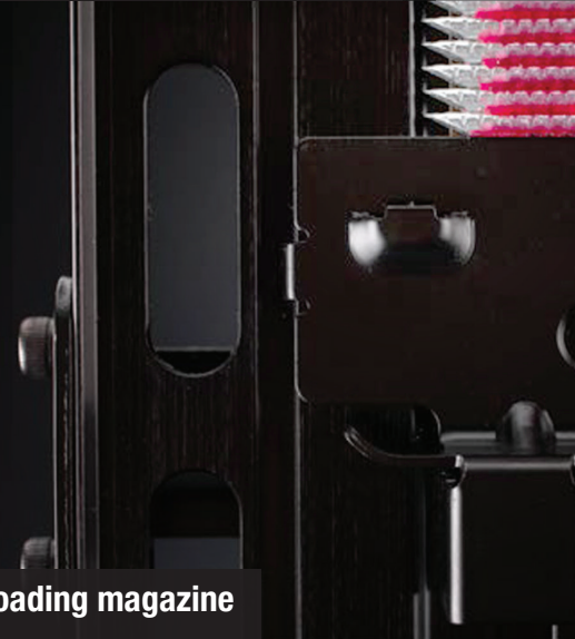
Easy loading magazine