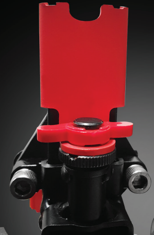
Easy tool free depth adjustment