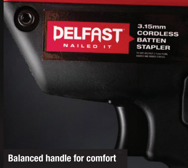
Balanced handle for comfort