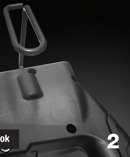
Swivel Belt Hook